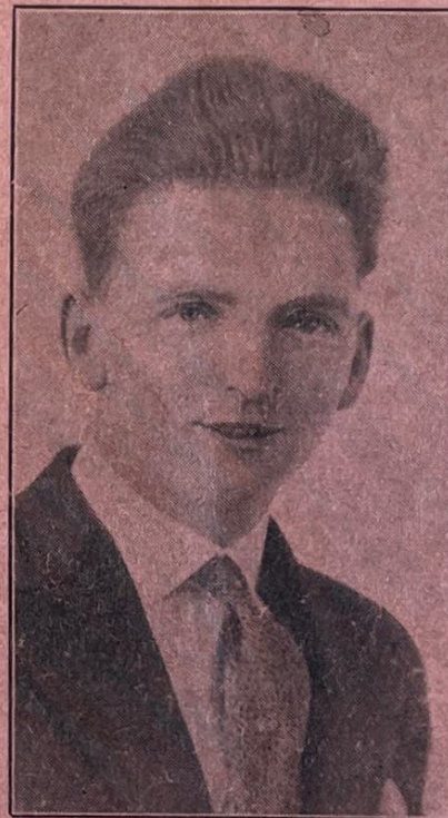
THE LATE CHAS. EGAN

The race is scheduled to finish at approximately 1.45 p.m. outside THE GRAND HOTEL - KALGOORLIE